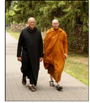
An interreligious tudong

Arriving at the trailhead, we were met by a reporter from the Brainerd Dispatch who interviewed and photographed us as we began our pilgrimage. We started out around quarter to four under an auspicious light rain. We walked for two hours (about six miles), at times in silence, at times talking about our hopes and expectations. Cautiously ignoring a "No Trespassing No Hunting" sign (we weren't going hunting, after all), we pitched our tents and settled in for our first night on the